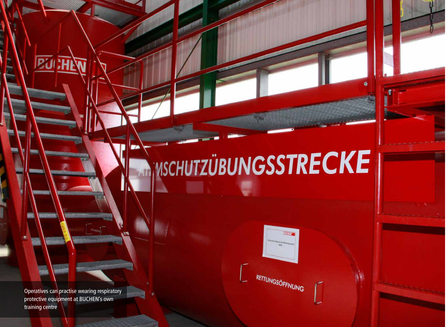
Operatives can practise wearing respiratory protective equipment at BUCHEN's own training centre