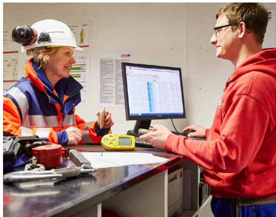
Equipment being handed out at one of our Safety Shops

The service technicians working in the BUCHEN Safety Shops hand out the safety equipment that is needed. The shops are staffed according to your requirements and are designed to meet the needs of your day-to-day business or special projects.